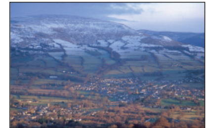
Crickhowell from Mynydd Llangattock