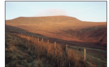
Waun Rydd from the flanks of Allt Lwyd