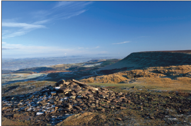
Hay Bluff from Twmpa