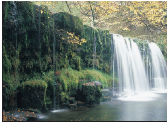
Sgwd Ddwli, Afon Nedd Fechan