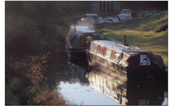
Canal Boats Gilwern Wharf