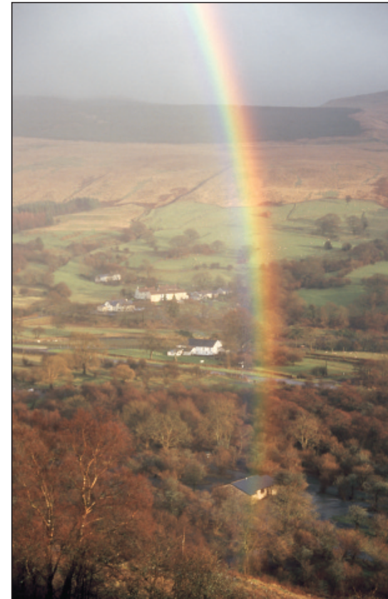
Rainbow over Glyntawe