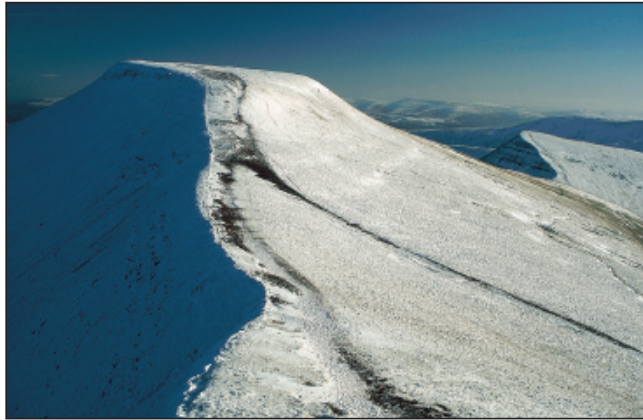
Pen y Fan from Corn Du